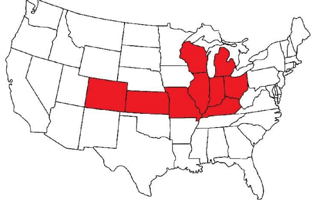
States represented at the Inaugural Midwest Campus Safety Summit

Jana's Campaign believes that the impact of the Midwest Campus Safety Summit on college campuses in the region will only increase as partnerships within the region grow stronger and the positive reputation of the Summit expands. Jana's Campaign looks forward to hosting the Midwest Campus Safety Summit for years to come and to witnessing the measured impact of the Summit as our nation's college campuses become safer environments for all students.