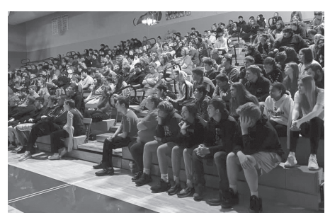
Royal Valley High School - General Assembly Pre-COVID