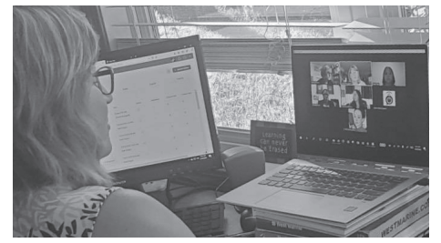
Virtual Missouri State University Public Affairs Conference