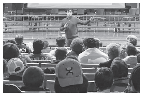
Cimarron High School - Man2Man Gender-Specific Presentation