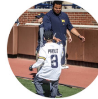
Grant Newsome @grant_newsome

Thank you @brendatracy24 for sharing your unbelievably powerful story and sharing your call to action. Real Men stand up and #SetTheExpectation